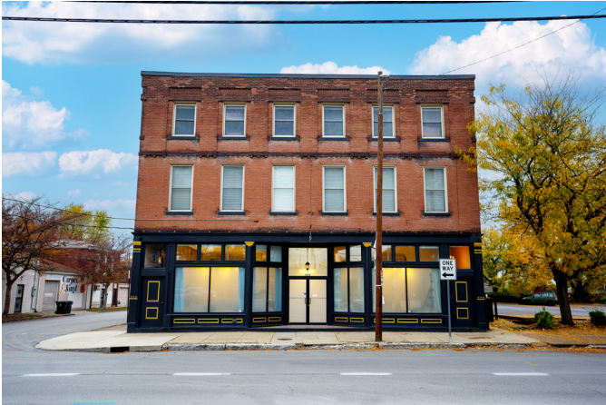
(Front view of The Swepson)