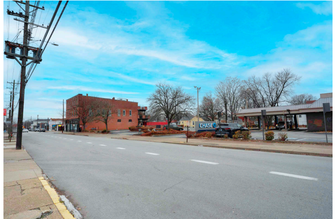
(View of The Swepson from down the street)