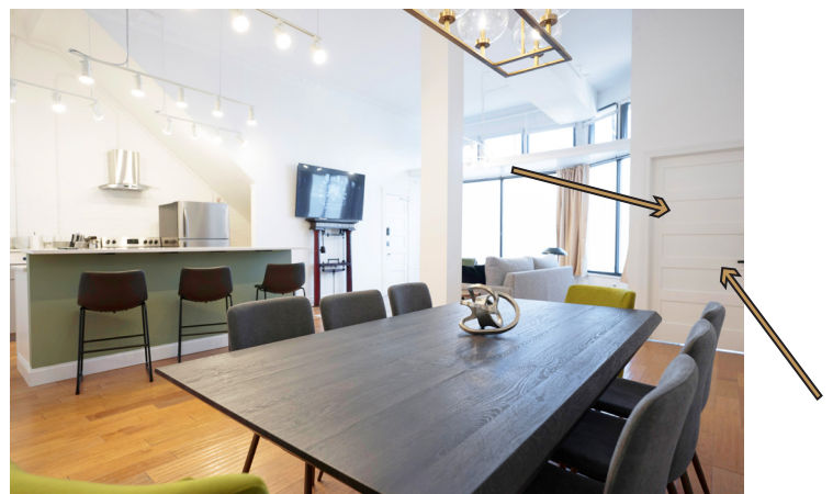
(White door inside Escape)