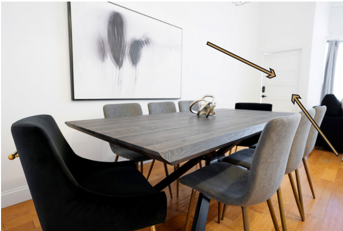
(White door inside Icon)